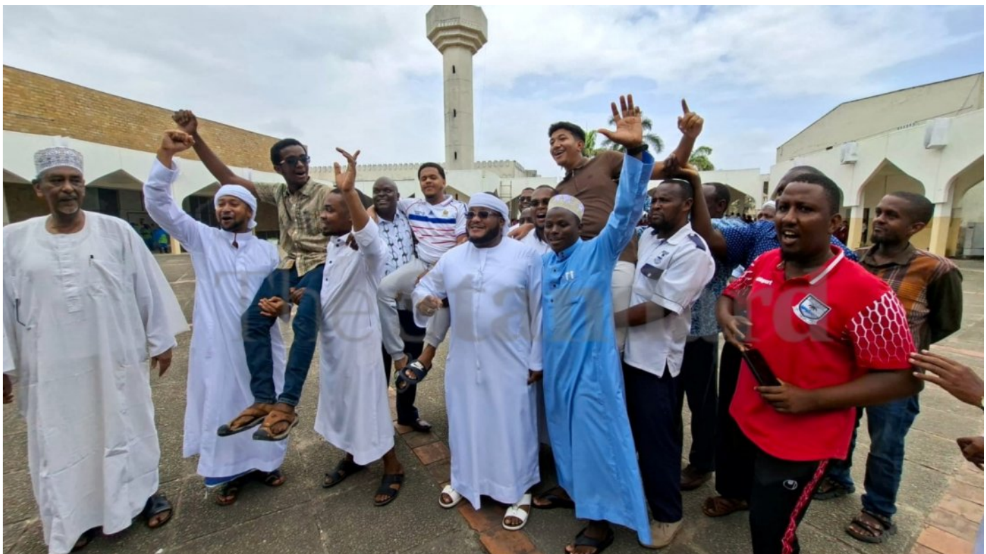
Sheikh Khalifa fraternity celebrating KSCE 2025 results with top students.