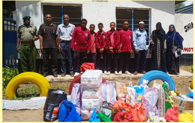
1. Shimo la Tewa Borstal Institution