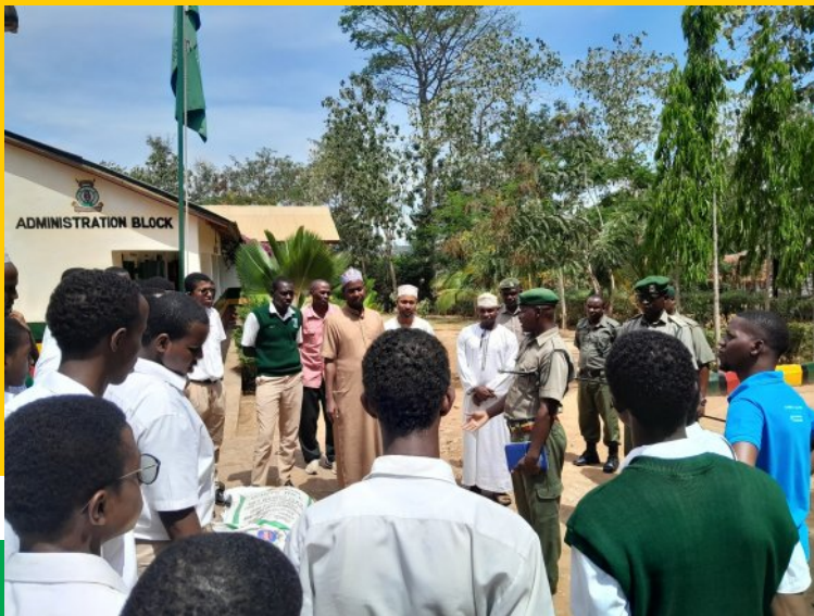
2. Kaloleni GK Prison