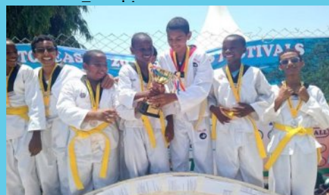
The crowned champions of Taekwondo at MSETO 2024 sports festival.